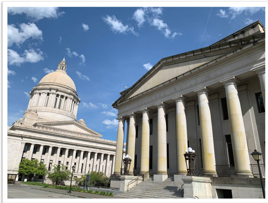
The Legislative Building and Insurance Building at the Capitol Campus in Olympia.